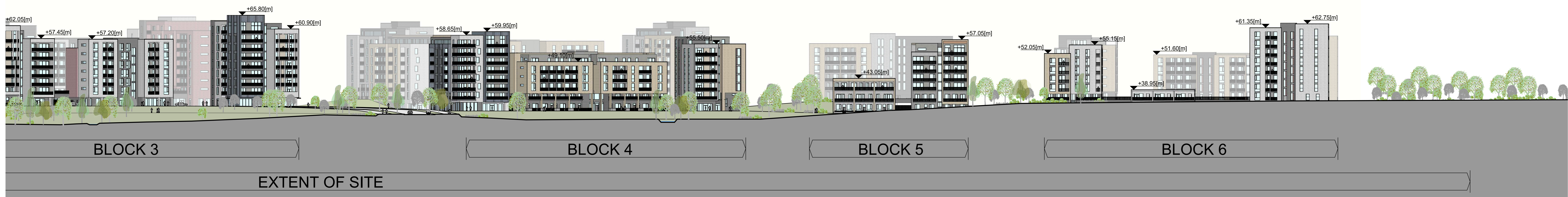
04 - Contiguous Elevation along River